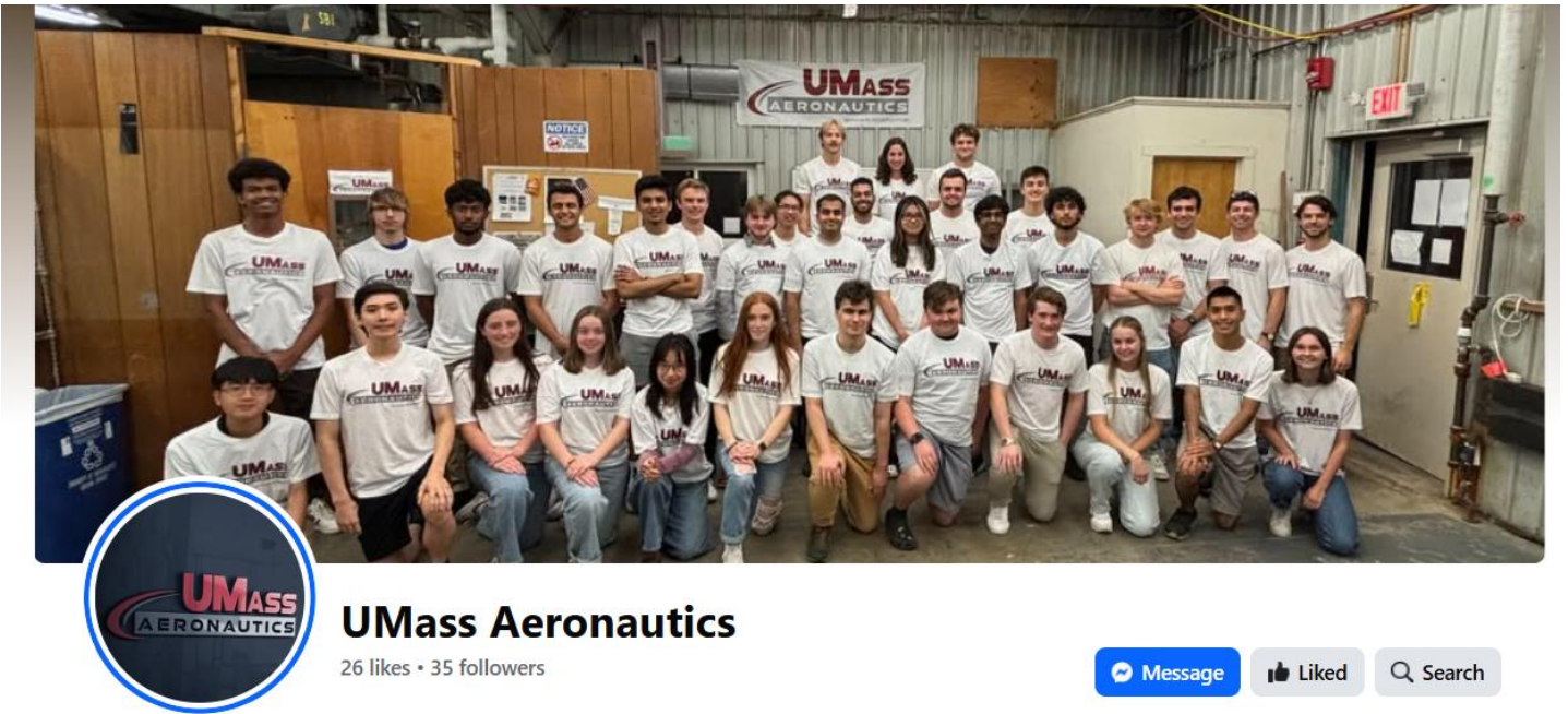
Entire UMass Aeronautics Club Members