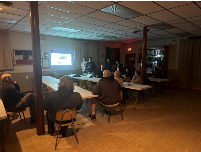
UMass Aeronautics Club team giving our club a presentation of their current AIAA 2025-2026 competition details