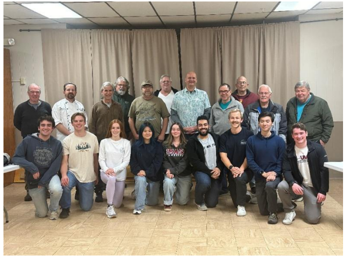
Both clubs group picture