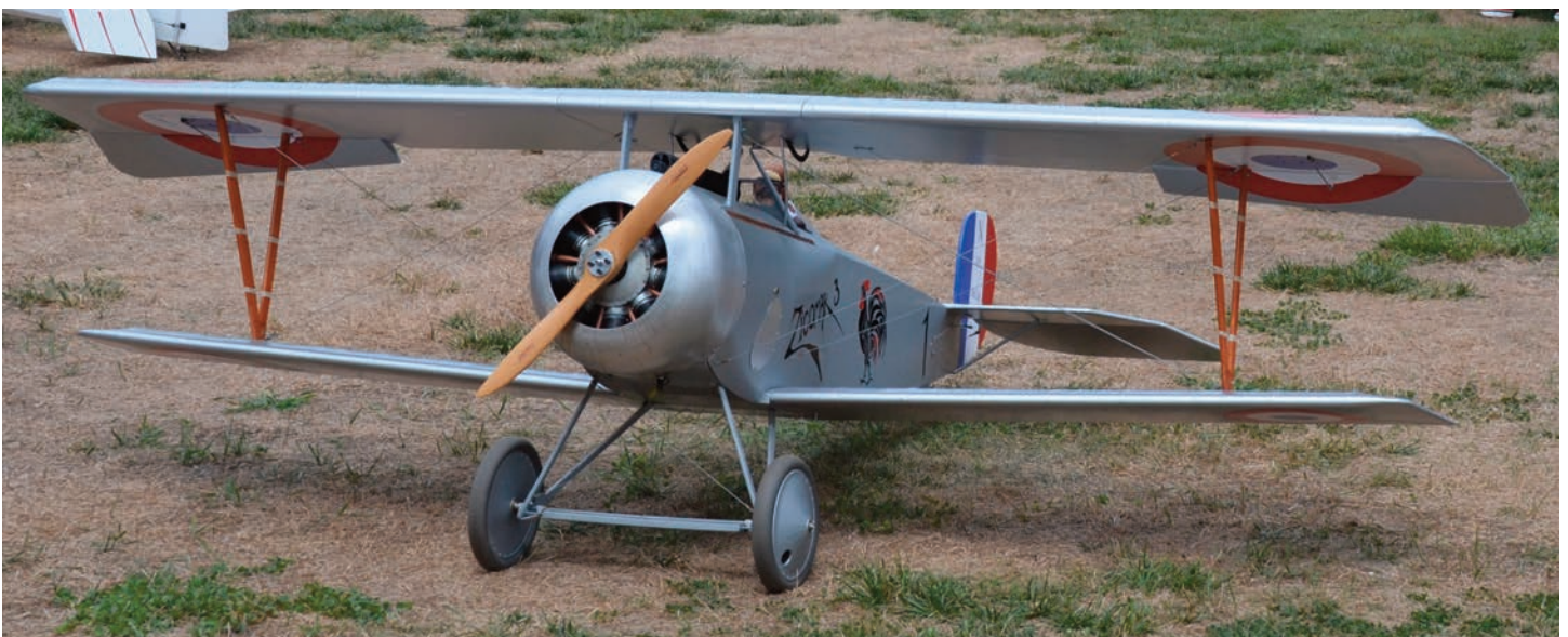
Dick Smith's winning 1/3 scale Nieuport 17 from a Balsa USA kit with a DLE 64 twin engine and Spectrum radio